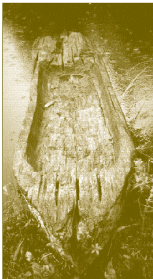
Figure 2 Small dugout canoe located near Johnstone Strait, Vancouver Island.

While western red and yellow cedar were the most important trees to northwest coast peoples, other species like hemlock, fir, pine, spruce, yew and alder were also valued for medicine, wood, dyes, fuel, food, pitch, and bedding (Mobley and Eldridge 1992:95; Pojar and MacKinnon 1994; Turner and Efrat 1982; Turner et al. 1983).