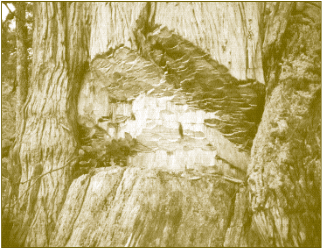
Figure 7 Example of cutmarks made by a metal axe on a test-hole tree. Located near Rugged Point, Kyuquot Sound on the west side of Vancouver Island.

Statements made by aboriginal people regarding the significance of these archaeological treasures often stress the link between CMTs, their ancestors, and living aboriginal culture. For Guujaaw, a Haida carver from Massett, CMT sites are sacred memorials to “. . . our ancestors who worked in the forests and created the canoes and totem poles for which the Haidas are known worldwide”, and they provide “. . . a sense of communion with the old canoe makers.” (Guujaaw 1990:2, 6). The CMTs at the S’yaal (Collison Point) site on Haida Gwaii are considered to be “. . . ‘living archaeology’ [that] presents a unique opportunity to get close to the activities of our ancestors in a live and dynamic setting” and “to our people the spiritual effects of being in the footsteps of our ancestors is the primary significance of the site.” (Guujaaw and Wanagun 1991:2).