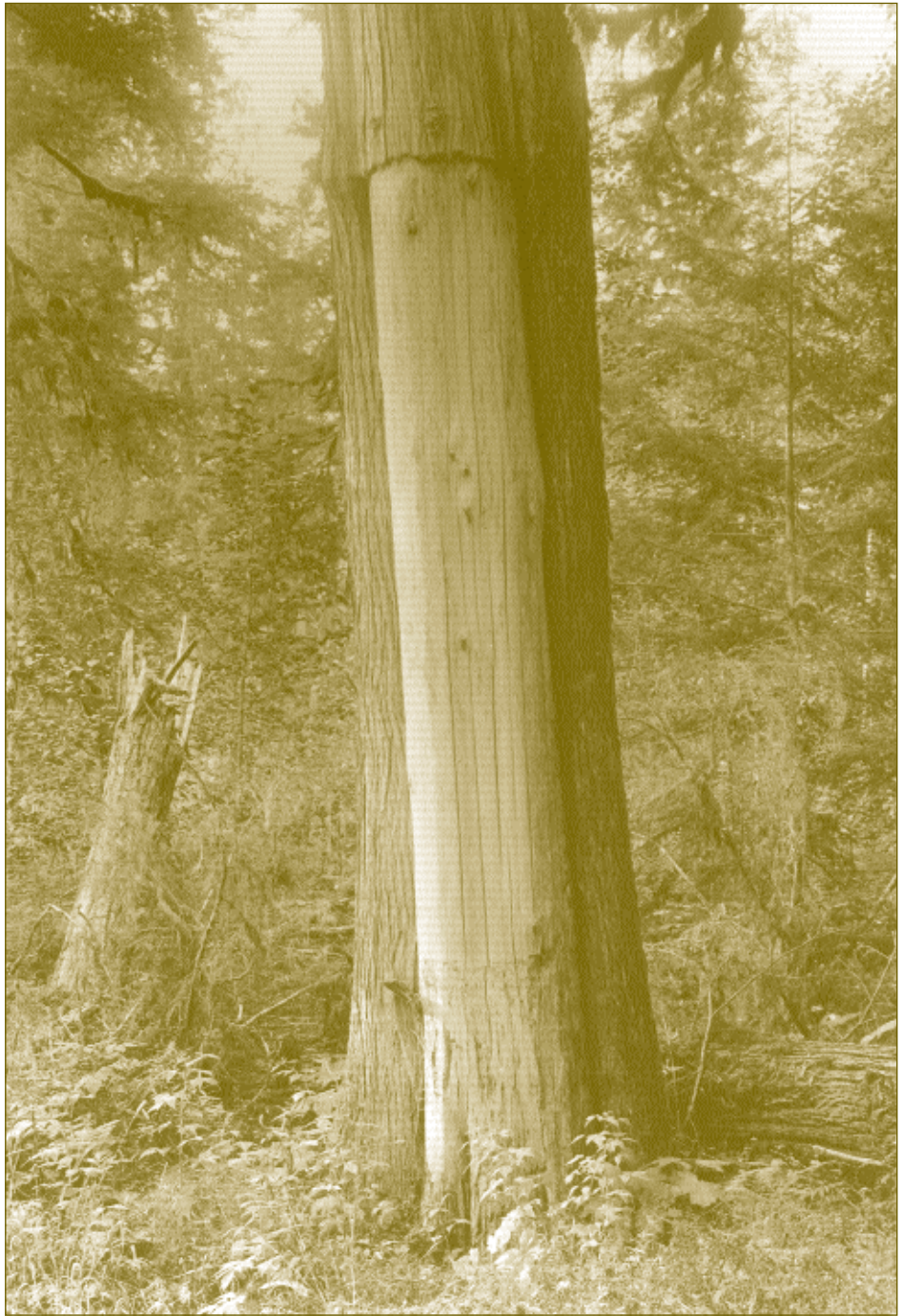
Figure 1 Culturally modified tree.