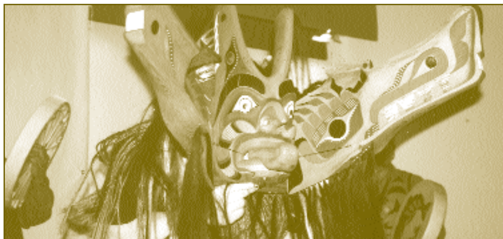
Figure 9 Kwakwaka'wakw transformation mask; carved in cedar by Simon Dick and family.

Stanley Park, in the heart of downtown Vancouver, contains numerous CMTs, although very few people are aware of the fact that native loggers used that forest long before the historic settlement and logging of Vancouver. Forest utilization sites such as this are easily accessible and contain a number and variety of well-preserved CMTs. They have high potential for development as tourist sites, with possible economic benefits to the adjacent communities through such things as guided tours, boat access, trail creation and maintenance, and local accommodation.