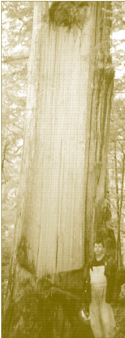
Figure 10 Planked tree. Located near Work Channel on the north coast of British Columbia.