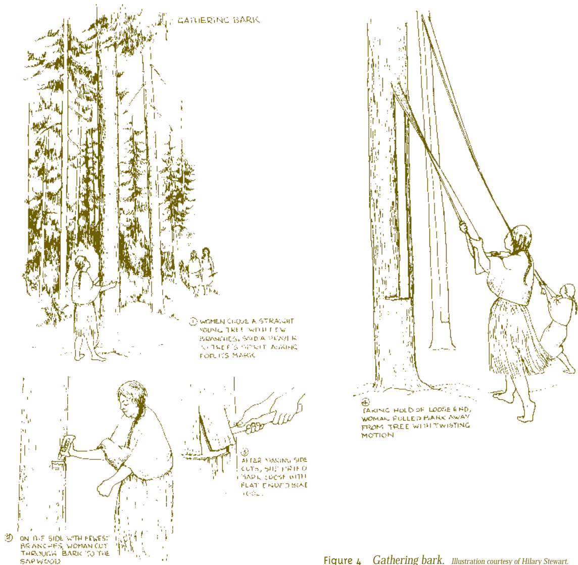
Figure 4 Gathering bark. Illustration courtesy of Hilary Stewart.

Douglas fir, yew, and some deciduous species, and used for a diversity of purposes including: food, medicine, dye, and fuel. CMTs of these species are relatively rare because, compared to cedar, they have lower resistance to infection and shorter life spans. The scars on CMTs from these varieties are