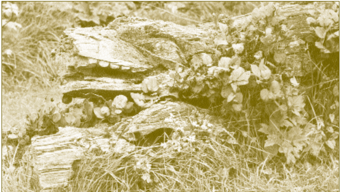
Figure 6 An example of the third type of CMT. An archaeological treasure from the Mamalilaculla Village, off the north coast of Vancouver Island.

The coastal rainforest is a living testimony to the strength, skill and knowledge of aboriginal woodworkers and barkworkers of the northwest coast. In a sense, it is a living museum that displays evidence of the tools, technology, and raw materials that shaped the lives of the people who used them. These remains, and the forests within which they are situated, have special significance for the descendants of the people who created them.