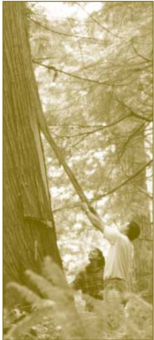
Figure 8 Bark stripping a cedar tree.

CMTs often have great time depth, and are therefore of value in providing easily accessed information about the nature of aboriginal society (Yahgulanaas 1998). As the Heiltsuk Tribal Council points out, CMTs preserve a partial, but compelling, record of aboriginal presence on the land and utilization of forest resources. In essence, they are “. . . a time capsule – one of the few remaining windows on a rich cultural heritage and ancient historical past” (Heiltsuk Tribal Council 1984). They can also provide information about events that may have occurred in more recent times, as Guujaaw suggests: “It appears to me that the dates when many of the canoes were left unfinished correspond to the dates of the smallpox epidemics which decimated the population of Haida people in the nineteenth century.” (Guujaaw 1990:6).