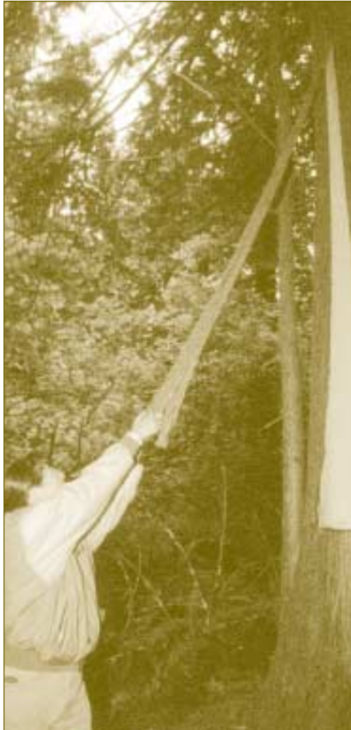
Figure 3 Bark stripping a cedar tree.