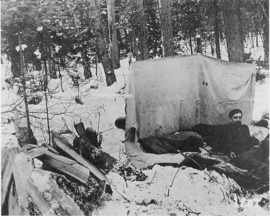
Gifford Pinchot camping in the Adirondacks, 1898

from several years of schooling in the forestry techniques of Europe to a United States bereft of any coherent forestry policy. He arrived with the fire of an evangelist eager to inspire a conservation great awakening with the principles of forest management he had learned in Germany and France. As he wrote in his autobiography, Breaking New Ground ,