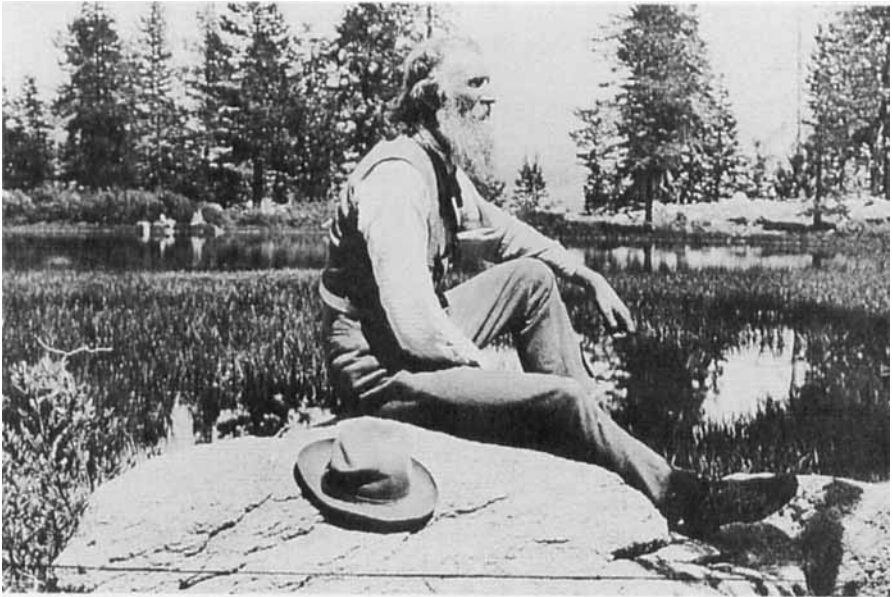
John Muir in the Sierra.

worked frantically behind the scenes and in public to get the bill voted down. Indeed, Muir's readers overwhelmingly supported the preservation of the Hetch-Hetchy. For them, Hetch-Hetchy and the Yosemite represented refuges that could serve as a temporary antidote to the stress of modern life.