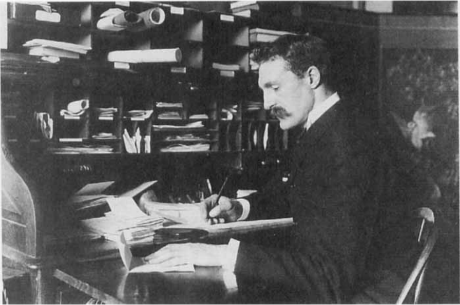
Gifford Pinchot at his desk, c. 1905

not the fundamental reason. . . . The law of self-preservation is higher than the law of business and the duty of preserving the nation is still higher. 28